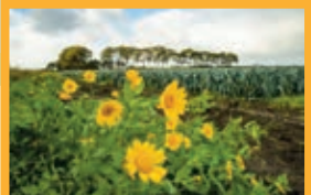
Leeks & Corn-Marigolds besides Mere Lane