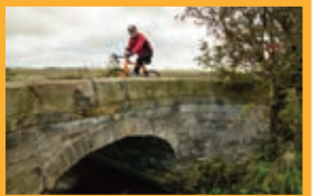
Sandy Way Bridge